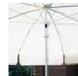
Primavera Classic with white powder-coated mast.