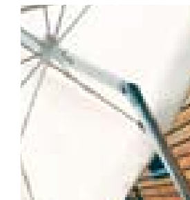
Equipped with a stable steel folding device, Primavera bends as you wish.

Primavera Aluminium with galvanised steel frame (4.5 mm diameter). Mast made of aluminium, diameter 36.5 mm. In two parts for space-saving transportation, connection using a snap fit. Mast not height adjustable.